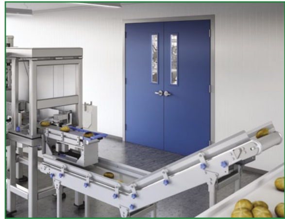
All-Fiberglass Flush Doors are FDA/USDA compliant