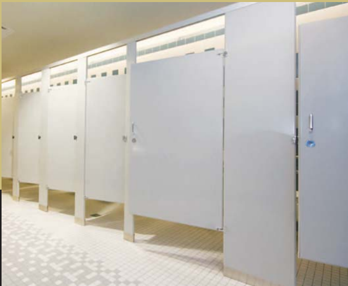
Standard partitions have open sightlines on sides and bottom.