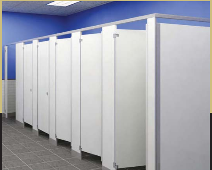
Ultimate Privacy eliminates sightlines into the compartment.